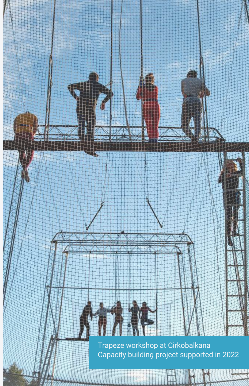
Trapeze workshop at Cirkobalkana Capacity building project supported in 2022