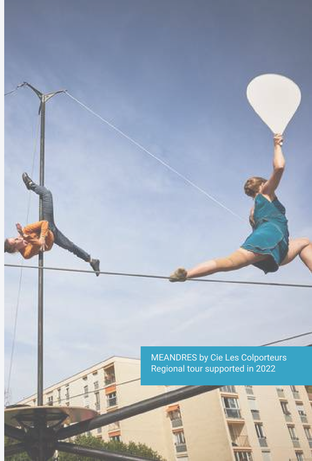
MEANDRES by Cie Les Colporteurs Regional tour supported in 2022