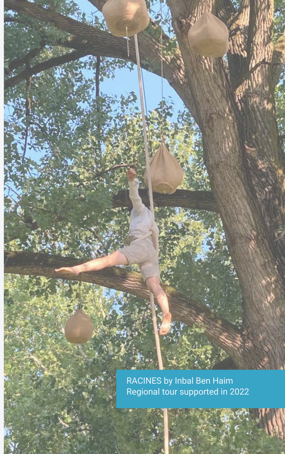
RACINES by Inbal Ben Haim Regional tour supported in 2022